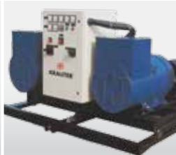
Frequency converters 50/60 Hz