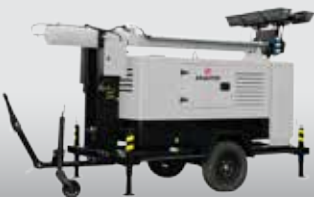
Customized generating units

For all our installations we manufacture the switchgear and control gear as well as the complete system solutions which are in use in hospitals as emergency power generators or as mobile generating units for a disaster area. These are also necessary in computer centers and in other sensitive systems where one commodity must always be available: electricity.